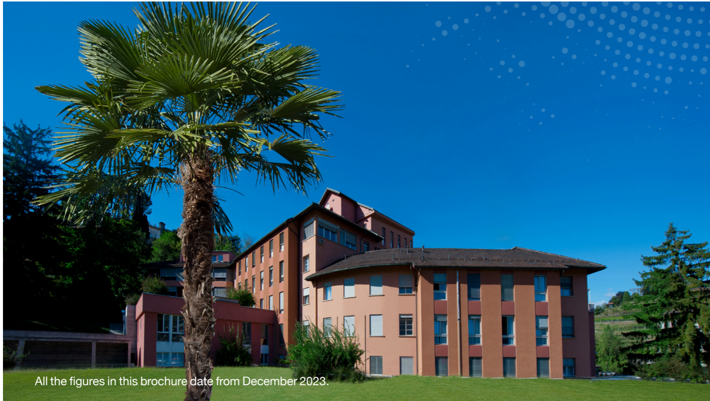
All the figures in this brochure date from December 2023.